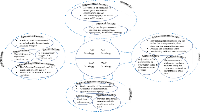
Fig 3: Matrix SWOT

After identifying the factors that determine the success of the toll road PPP, then interviews with stakeholders regarding the strategy in meeting the factors that drive the success of the Manado-Bitung toll road PPP are conducted. The interview results will then be grouped into an analysis of the internal and the external environment. External environmental analysis is an analysis of external factors or situations and conditions that are outside the organization, which in this case is the government and business entities, which can affect directly or indirectly the organizational performance of the government and business entities. The purpose of the external analysis is to develop a list of opportunities (opportunities) that can be exploited by the organization and a list of threats that the organization should avoid. Internal environmental analysis is an analysis to formulate and evaluate the strengths and weaknesses of the organization.